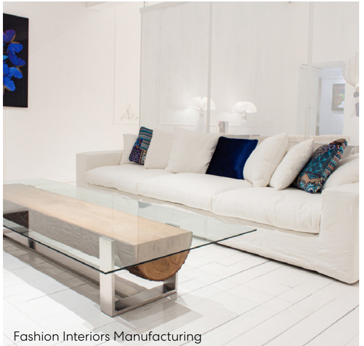
Fashion Interiors Manufacturing

Each company featured in SALON is carefully vetted and hand-selected. We scour the planet to find the newest and finest home furnishings companies, providing buyers with new resources and the latest products each market.