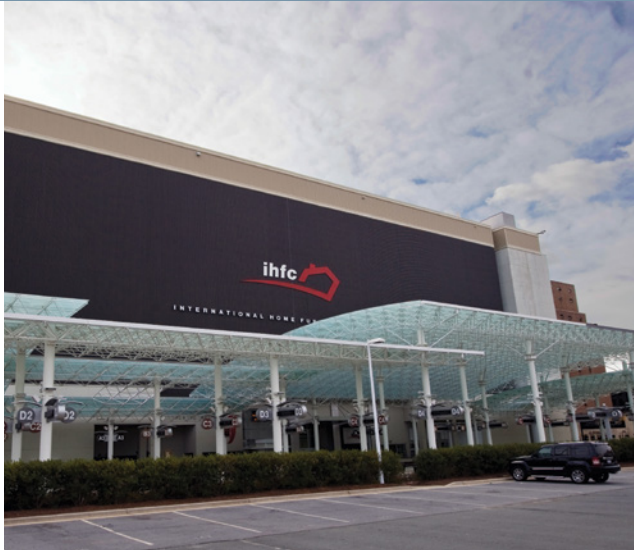
EXHIBIT SPACE AND SUPPORT