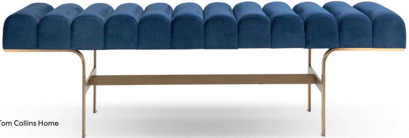
Tom Collins Home

INTERHALL, a juried collection of design-driven, lifestyle-focused home furnishings, is the premier destination for fresh, new and exciting resources representing all styles – from traditional to contemporary. Buyers and designers flock to INTERHALL for one main reason: to find The Next Big Thing. DISCOVER IT.